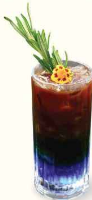
MIDNIGHT BLUE 130 Espresso, mango juice, lemon juice, Blue Curacao syrup, mango syrup, topped with soda

Prices are in Thai Baht and exclusive of government tax 7% and service charge 10% ราคาตั้งหลักเป็นเงินบาท ไม่รวมภาษีมูลค่าเพิ่ม 7% และค่าบริการ 10%