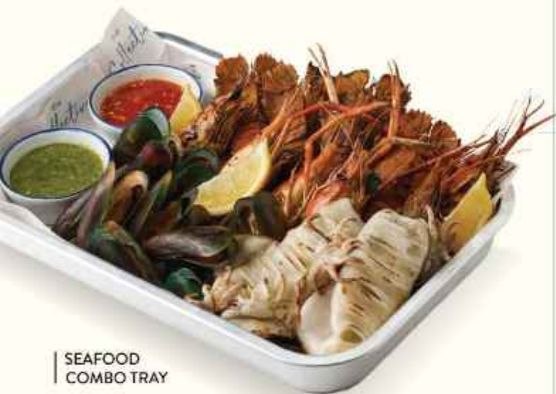
SEAFOOD COMBO TRAY