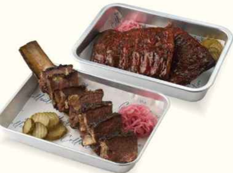
| BEEF SHORT RIB