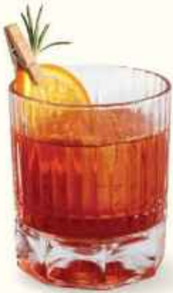
OLD FASHION 290