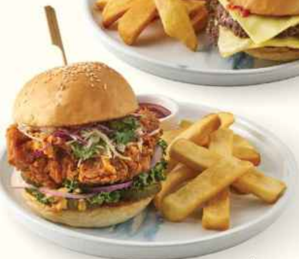
FRIED CHICKEN BURGER