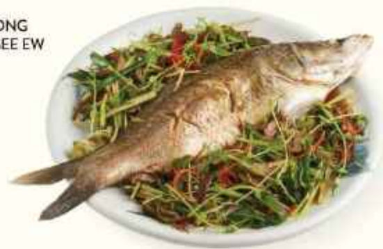
PLA KAPONG NUENG SEE EW