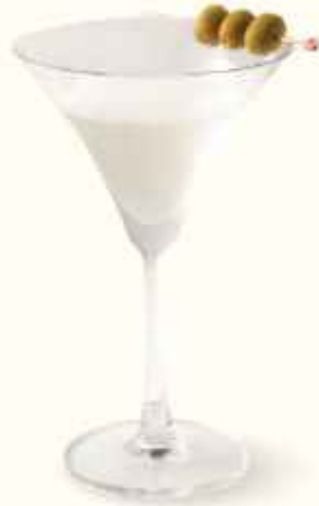
CLASSIC MARTINI 290