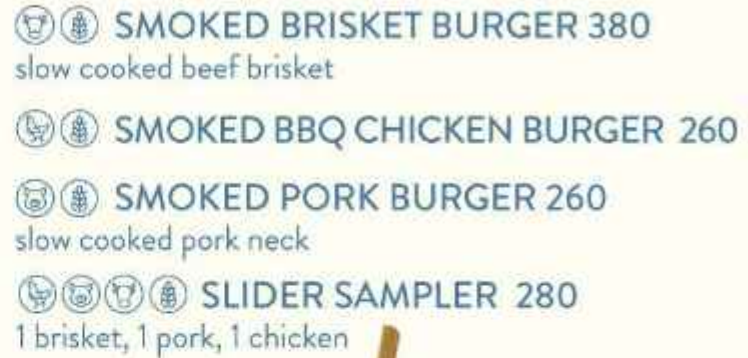
| SLIDER SAMPLER