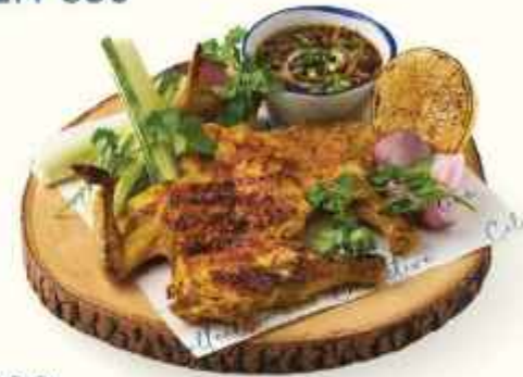
| TURMERIC COCONUT CHICKEN