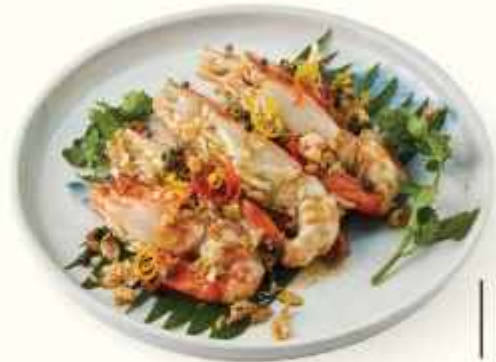
GOONG TOD KRATIEM PRIK THAI