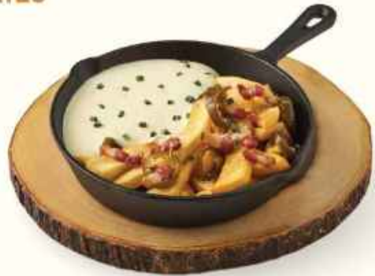
LOADED CHEESE FRIES