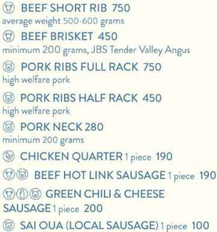
| PORK RIBS FULL RACK