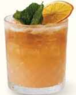
MAI TAI 290