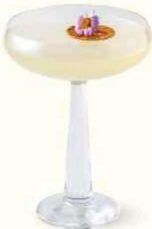
LIME DAIQUIRI 290