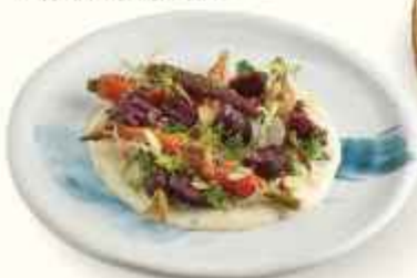
ROASTED BABY BEETROOT & CARROT SALAD