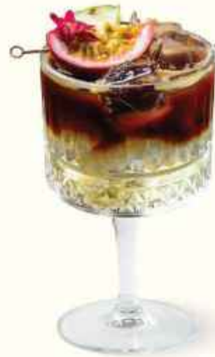
DE PASSION PINE 130 Espresso, passion fruit, pineapple juice