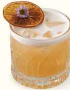
WHISKEY SOUR 290