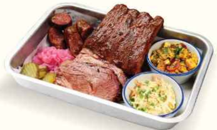
SOLO COMBO PLATTER

Beef Brisket 150 grams, JBS Tender Valley Angus Pork Ribs quarter rack, high welfare pork Green Chili & Cheese Sausage 1 piece 2 Side Dishes