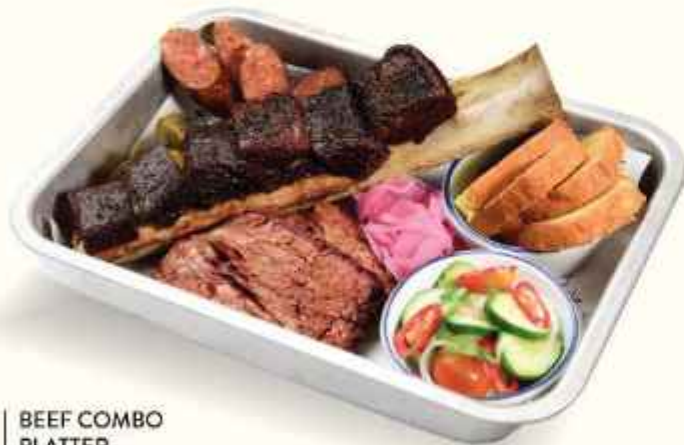
BEEF COMBO PLATTER

Beef Short Rib 1 piece Beef Brisket 250 grams, JBS Tender Valley Angus Beef Hot Link Sausage 1 piece 2 Side Dishes