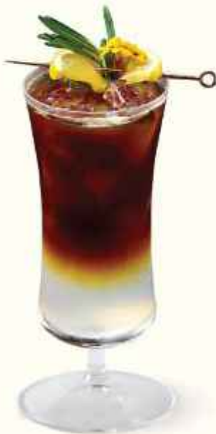
BLACK LEMON SPARKLING 130 Espresso, Schweppes lemon