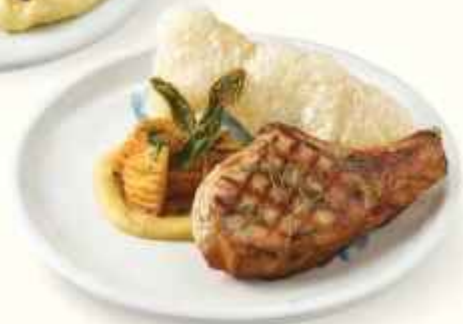
| PORK CHOP