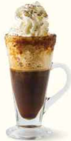
IRISH COFFEE 290

MANHATTAN 290 PINK LADY 290 SCREWDRIVER 290 BLUE HAWAII 290