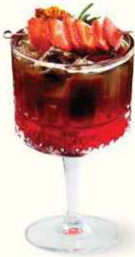
ROSE GARDEN 130 Espresso, lemon juice, strawberry syrup