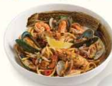
BUCATTI FRUTTI DI MARE

filled with pancetta, red onion, parmesan cheese, crispy pancetta, egg yolk, parmesan cream