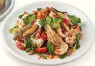
YAM RUAM MIT TALAY