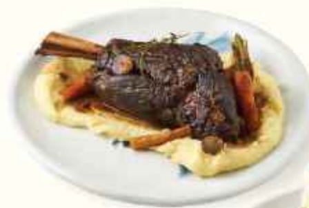
| LAMB SHANK